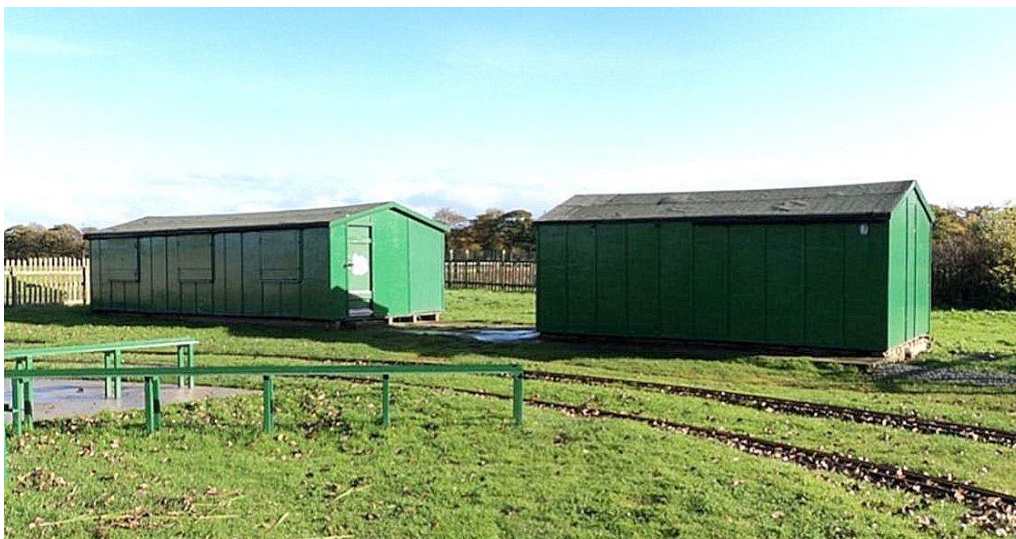
The old Clubhouse (left) and Workshop buildings

The old wooden Clubhouse buildings were rotten and had suffered a number of break-ins, including one where they lifted the roof to gain access ! What had been a “workshop” had become a store, too cold and damp for machinery. We had no toilet facilities, and only a sink, cooker and short counter for a kitchen.