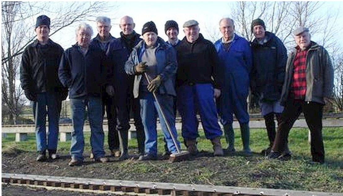
The Track Gang

On May 23 rd , 11 years ago, we received planning consent for a new Clubhouse. This was the next step in the development of TSMEE. The raised track had been renewed and the ground-level track installed thanks to the hard work of a number of members.