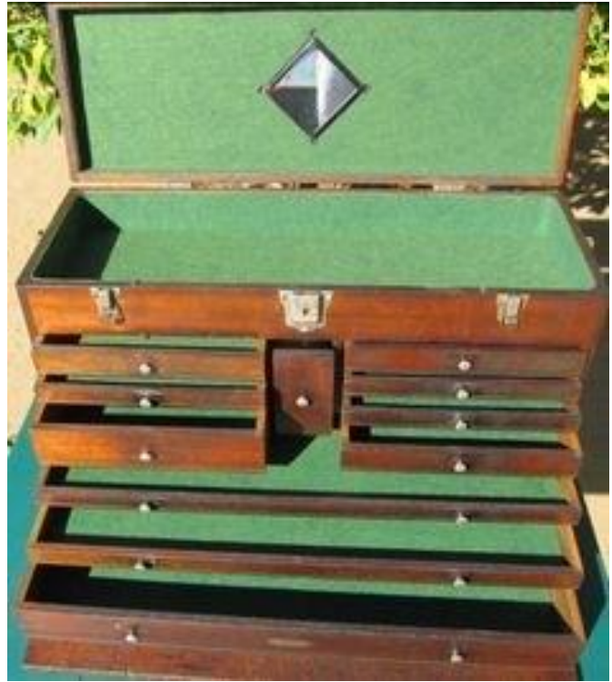
Left – my two Union toolchests are slightly different. Right – Gerstner toolmaker chest