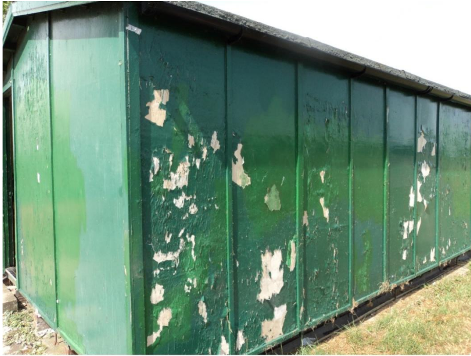
The deteriorating condition

The Committee knew something had to be done, but finance was a massive issue. The first step was to negotiate a new twenty-five year lease with the City Council, the previous one was for six months. We could not invest thousands in a new building without some security.